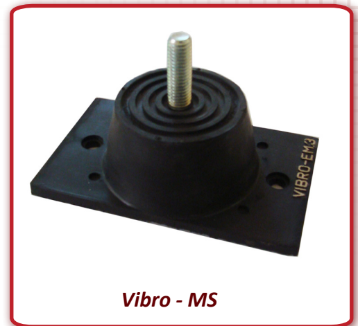
Vibro - MS

Natural frequency (at maximum load) : 8 Hz