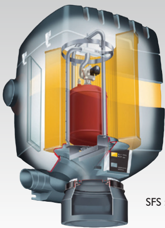
SFS : RoboClean® system

The SFS has the RoboClean® system and a large 30 m 2 (325 ft 2 ) filter (as cassette), treated with SurfacePlus®. This gives the SFS a very special position in the self-cleaning filter market. The automatically initiated, powerful and deep-working blast of air penetrates into every section of the filter. This is beneficial because it means longer intervals between the pulses, which results in lower energy costs for the customer and a more consistent extraction flow for the welder. The residue is collected in a container, making it easy to remove. No other device on the market is comparable to the stationary Plymovent SFS welding fume filter in terms of price and performance.